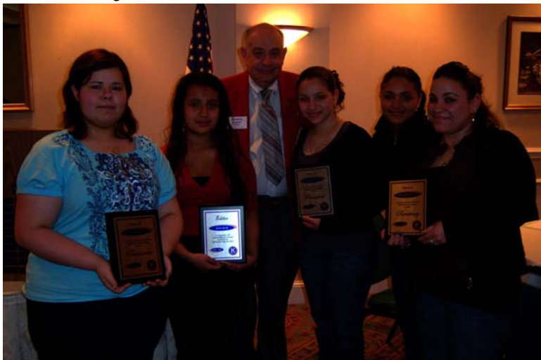
Outgoing East Boston High School Key Club Officers 2008-09