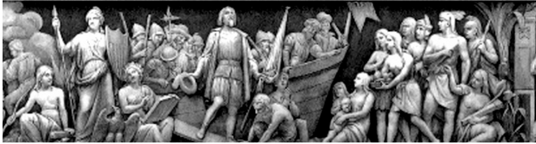
America in History